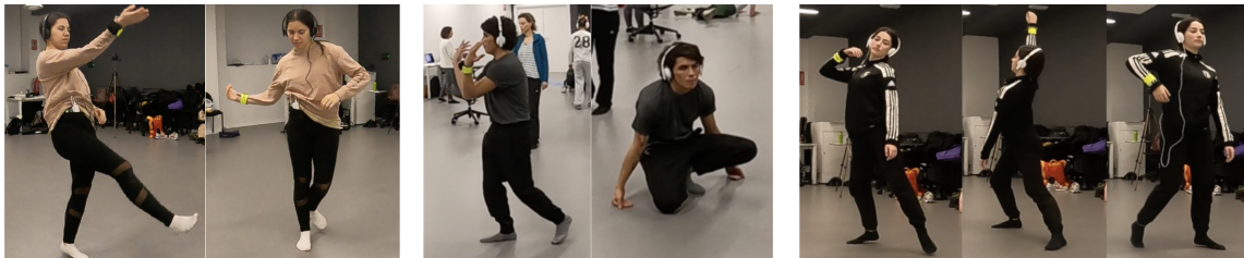
Fig. 1. Stills from participants moving with the SoniBand