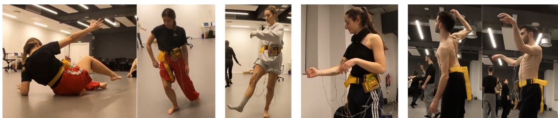
Fig. 3. Stills from participants moving with the Joakinator