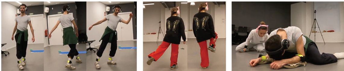
Fig. 2. Stills from participants moving with the SoniShoes