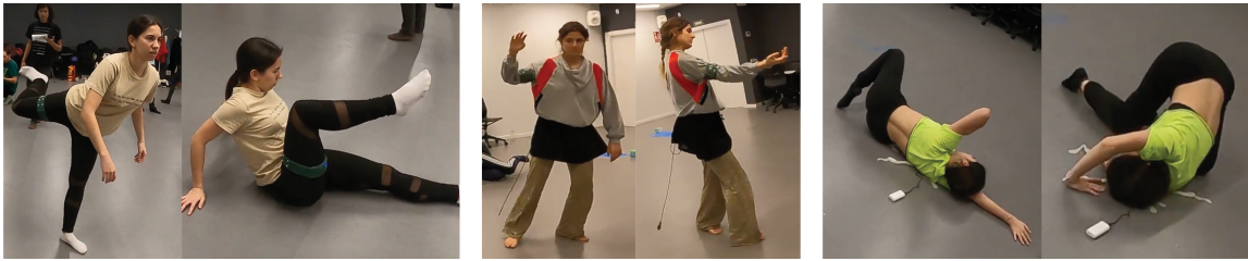
Fig. 4. Stills from participants moving with the Vibrants

1 2 3 4 5 6 7 8 9 10 11 12 13 14 15 16 17 18 19 20 21 22 23 24 25 26 27 28 29 30 31 32 33 34 35 36 37 38 39 40 41 42 43 44 45 46 47 48 49 50 51 52